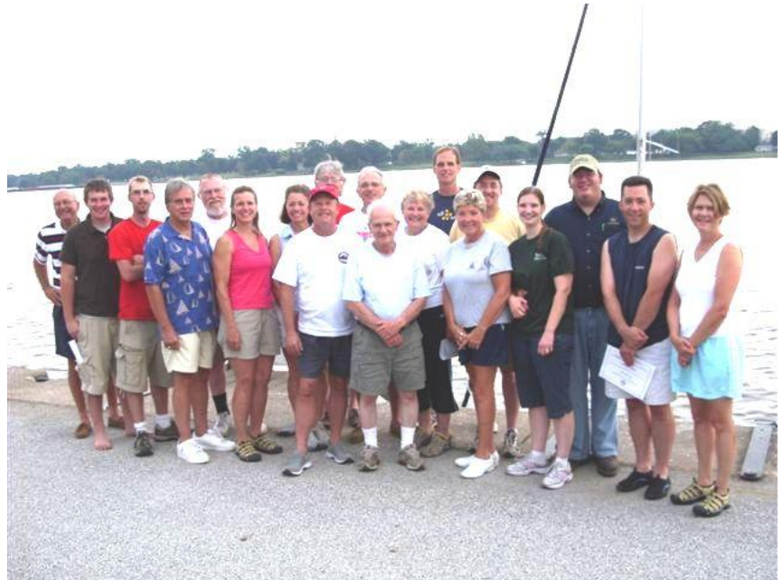
The First Sailing School Class of 2008

They have all been encouraged to come and participate in races or take the school boats out (during race times). If you see them at the club, please welcome them.